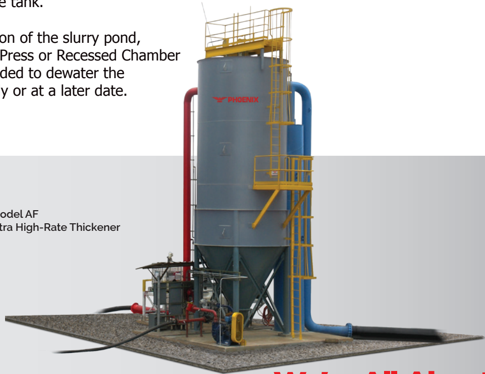
PHOENIX Model AF AltaFlo™ Ultra High-Rate Thickener

Available in several sizes, general or seismic design and options including local control panel, bed level sensor and pressure transmitter.