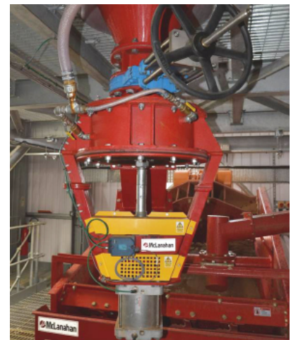
Linear CV “dart” style underflow valve provides hydraulic stability and perfect valve capacity