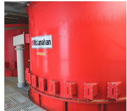
Side removable teeter water pipes eliminate the need for entry into confined spaces to perform routine maintenance

The McLanahan Hydrosizer's™ circular section means an equidistant entry and exit path for the overflow fraction and “dead areas” associated with square Hydrosizers™ are eliminated. Our linear CV “dart” style underflow valve accepts a range of trim profiles, providing hydraulic stability and perfect valve capacity every time. The valve's internals are easily serviced in place without resorting to lifting tackle and without disturbing any process pipe-work. The intelligent I/P positioner even provides an electronic outward indication of internal condition.