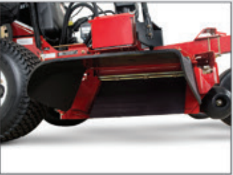
OPERATOR CONTROL DISCHARGE (HAND)

Also Available: Anti-Scalp Roller Kit, Cup Holder, Equipment Cover, Jack, Jack Mount Receiver, Trash Container, Weight Kit Accessories may not fit each mower model. Please visit exmark.com or check with your local dealer on accessory fit-up for each model.